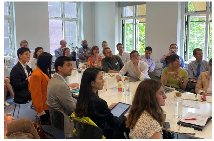
{\it Picture: Workshop\ at\ The\ Second\ Copenhagen\ Money\ in\ Politics\ Conference\ at\ EGB.}

The conference encompassed numerous fruitful discussions and was a success. Continuously holding the Money in Politics Conference at EGB increases the department's visibility. We will again hold this conference at EGB in June 2024 in cooperation with Princeton University's Politics Department.