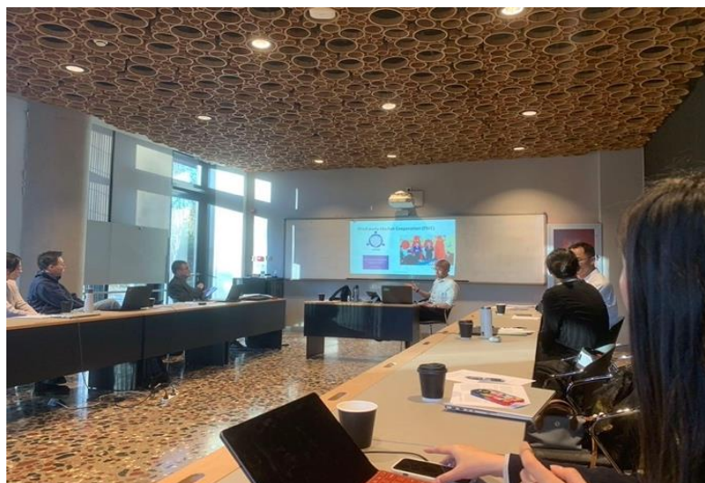
Picture: Workshop on Investment, Trade and Geo-economic Challenges, held at SDC