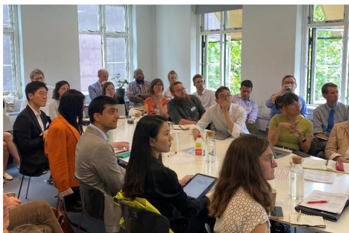
Picture: Workshop at The Second Copenhagen Money in Politics Conference at EGB.

The conference encompassed numerous fruitful discussions and was a success. Continuously holding the Money in Politics Conference at EGB increases the department's visibility. We will again hold this conference at EGB in June 2024 in cooperation with Princeton University's Politics Department.