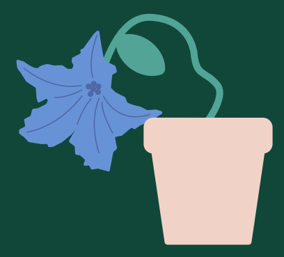
Autumn CBS Sustainability Advisory Team Consultation